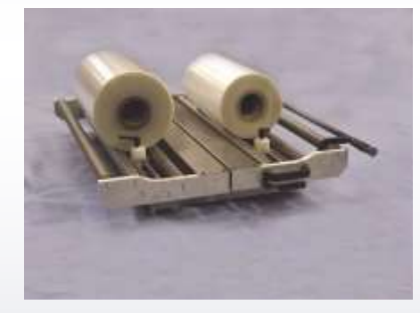
Easy load film racks