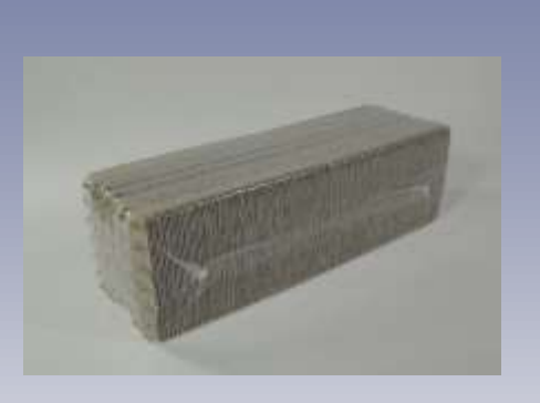
Total film enclosure available