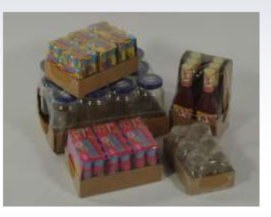
Samples of actual products run on APM Machinery equipment

Single and double stacked products can too!