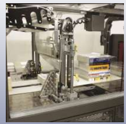
Fully supported seal frame and carriage